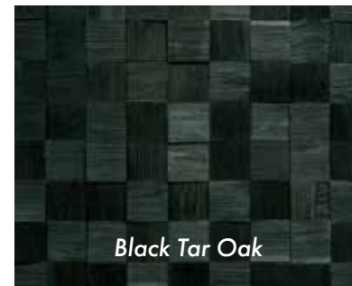
Black Tar Oak