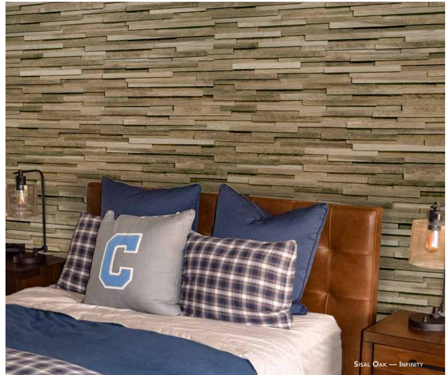
SISAL OAK — INFINITY