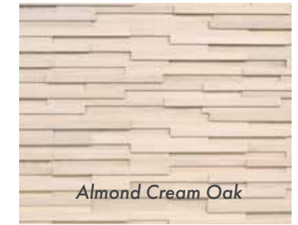
Almond Cream Oak