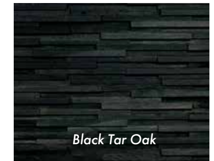
Black Tar Oak