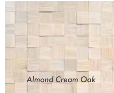
Almond Cream Oak