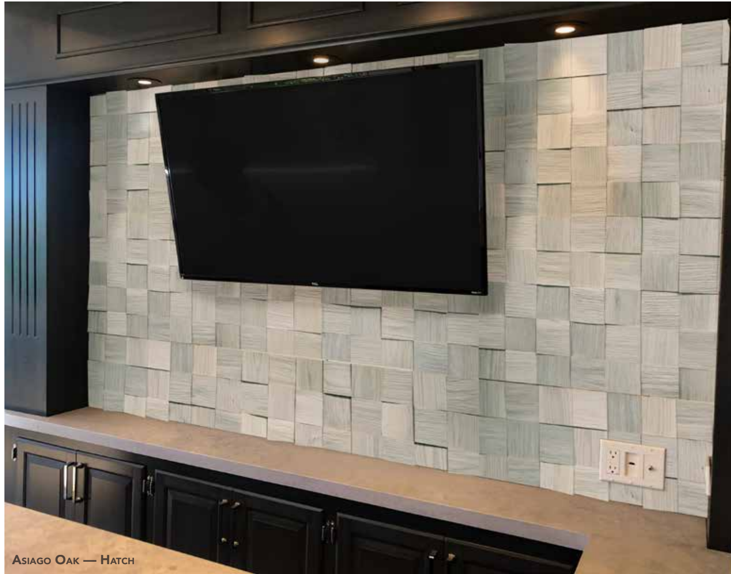
ASIAGO OAK — HATCH