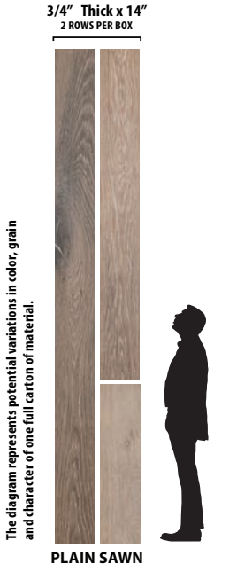
represents potential variations in color, grain ENGTH DESCRIPTION (23"-10") and character of one full carton of material. The diagram PLAIN SAWN

FOR MORE INFORMATION ABOUT MICROBAN® VISIT US AT RHONEFLOORING.COM/MICROBAN