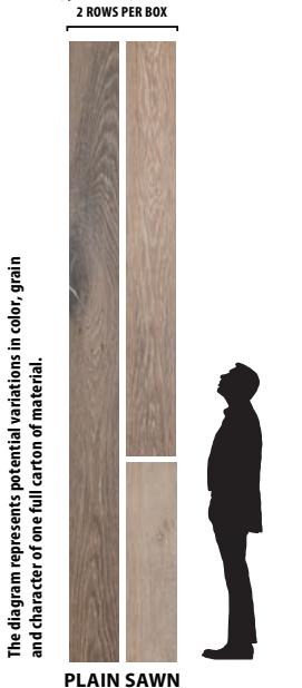
represents potential variations in color, grain ENGTH DESCRIPTION (23"-10") and character of one full carton of material. The diagram

FOR MORE INFORMATION ABOUT MICROBAN® VISIT US AT RHONEFLOORING.COM/MICROBAN