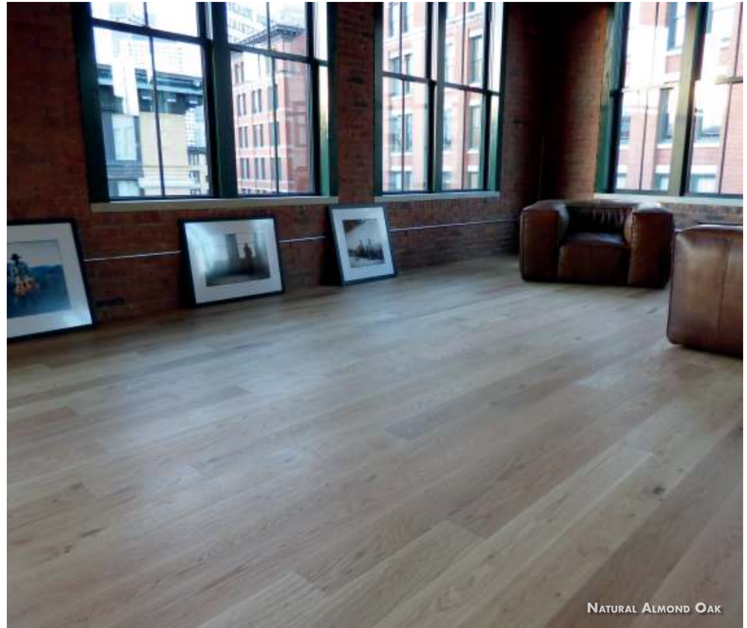
NATURAL ALMOND OAK