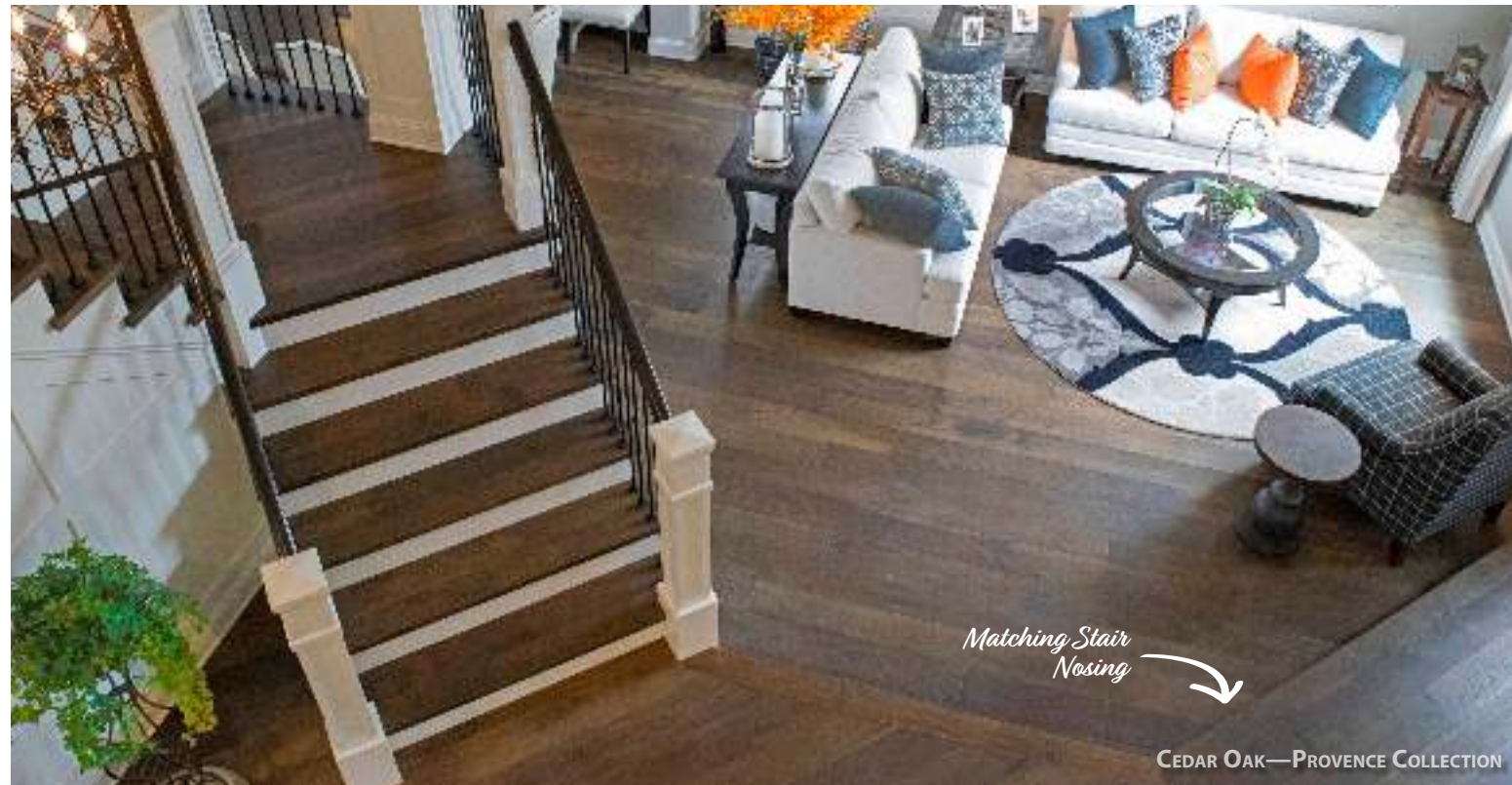
CEDAR OAK—PROVENCE COLLECTION