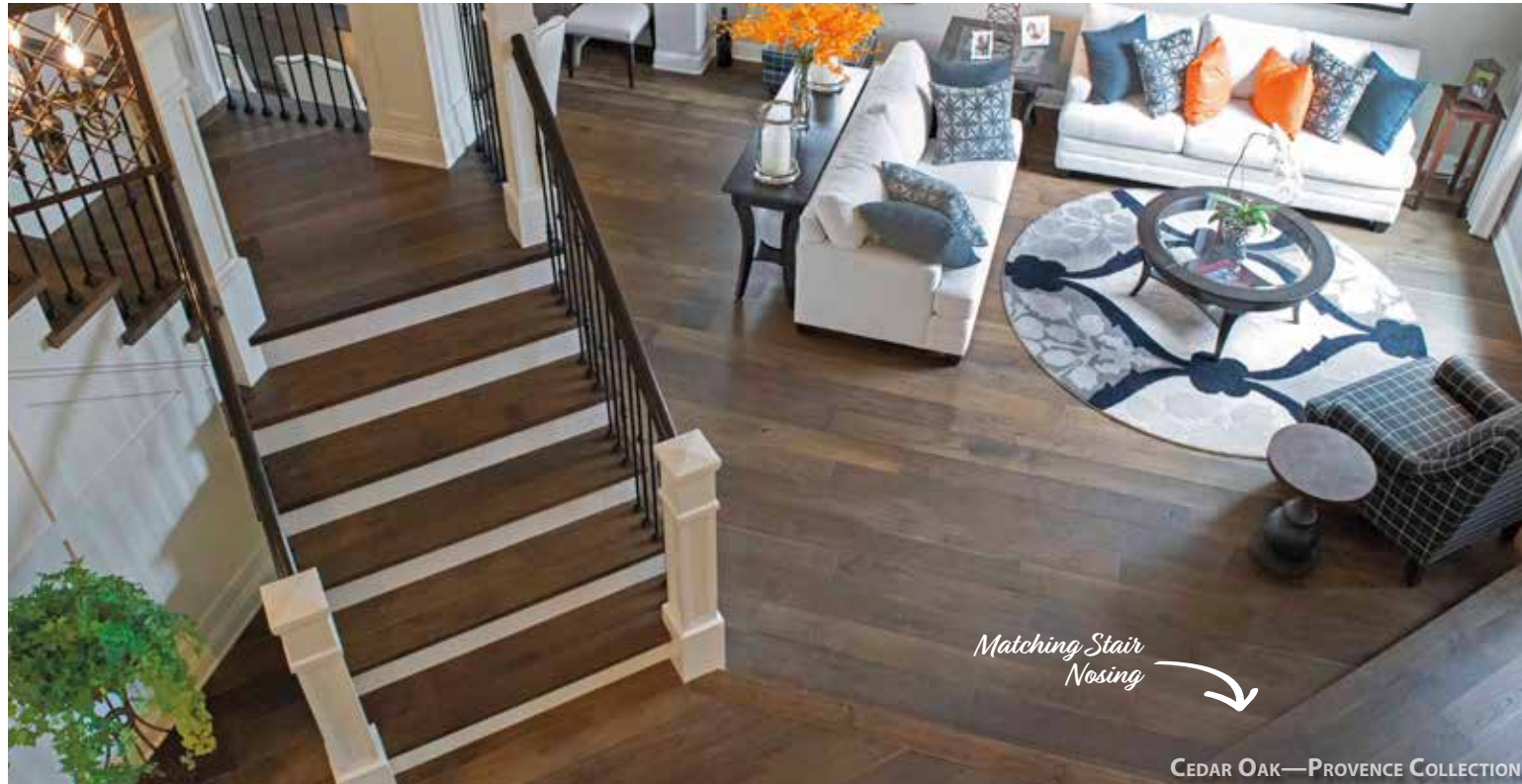
\mbox{\bf NOTE:} There may be a seam present on the Fabricated Stair Nose.